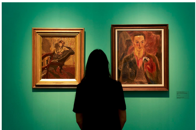
Conspired: Masterpiece by Biggs & Collings (2019) on show at London Art Fair 2019. Works from Towner Art Gallery, Museum Partner for London Art Fair 2019.

London Art Fair concluded its 31st edition on Sunday 20 January, reporting robust sales across modern and contemporary art and welcoming over 20,000 international visitors and collectors, despite uncertainty over Brexit. The Fair opened with a Preview Evening on Tuesday 15 January, when collectors, curators, artists and art enthusiasts enjoyed an exclusive first look at presentations by 130 leading galleries from 16 different countries, brought together under one roof at the Business Design Centre.