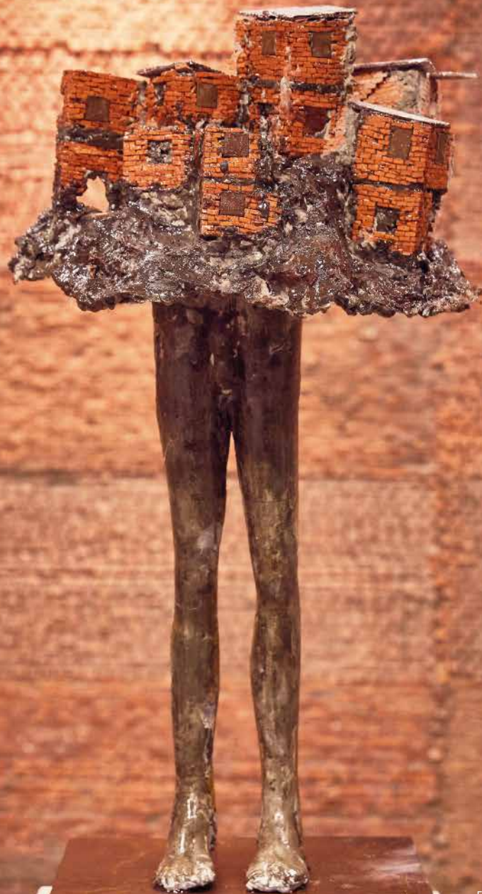
ED CROSS FINE ART Work by Cesar Cornejo London Art Fair 2020